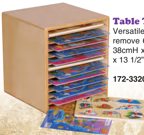
Table Top Puzzle Rack

Versatile, portable storage of 12 puzzles or remove 6 shelves and store 6 knob puzzles. 38cmH x 34.5cmW x 34.5cmD (15" x 13 1/2" x 13 1/2").