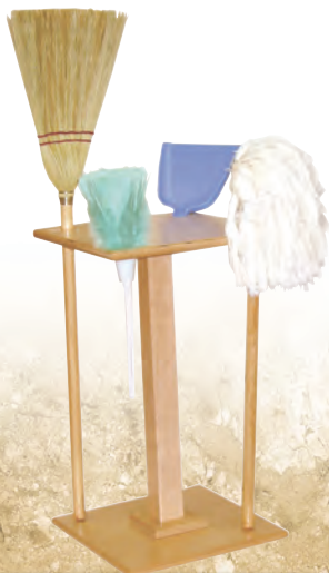
Cleaning Tools May Vary in Style